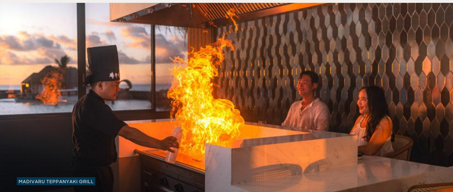
MADIVARU TEPPANYAKI GRILL

The culinary creations feature hand-picked ingredients sourced from Veligandu's lush natural gardens and nearby local islands, ensuring that each dish bursts with freshness, flavor, and vibrant colors.