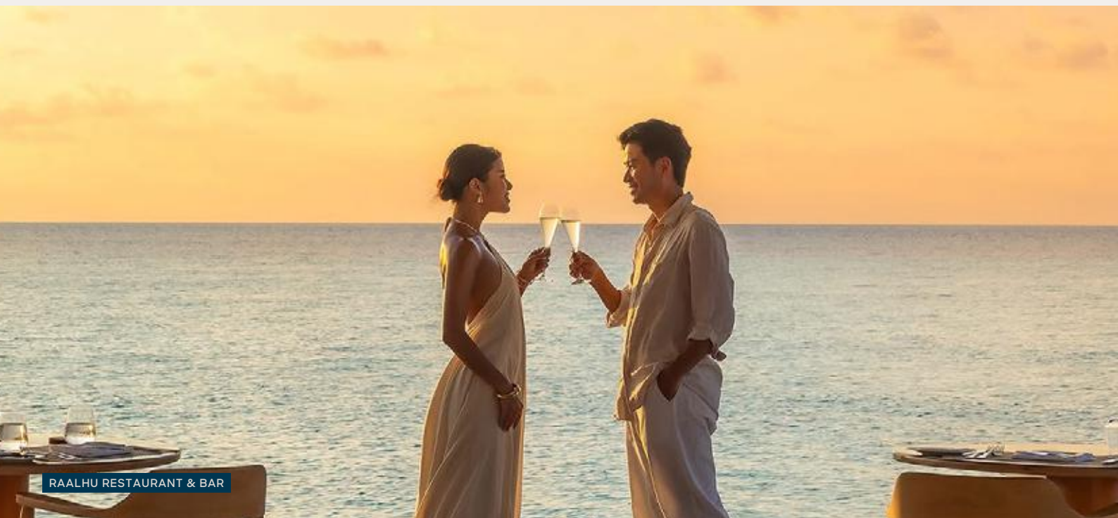
RAALHU RESTAURANT & BAR

Raalhu Champagne Pavilion is a paradise of pleasure for those who long for the sight and taste of champagne and the magical colors of the setting sun. This luxurious spot offers some of the world's finest champagnes as the sun paints its hues of twilight in the sky. It is the perfect place for newlyweds and lovers to truly reconnect and celebrate their special love.