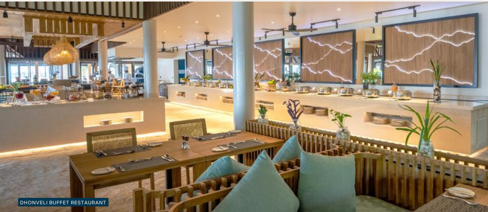
DHONVELI BUFFET RESTAURANT

Veligandu has elevated its island culinary offering with a combination of casual gourmet and fine dining experiences . Guests can be swooned away in the buffet restaurant, as well as explore the dine-around options during their stay in the two modern à la carte restaurant options or relax and stay indoors while exploring the in-villa dining menu . On top of it all, guests also have access to the Infinity Pool and Snack Bar Menu , with a serene ambiance of stunning views for a leisurely brunch, lunch, or late afternoon snack that will leave the palate enticed for more.