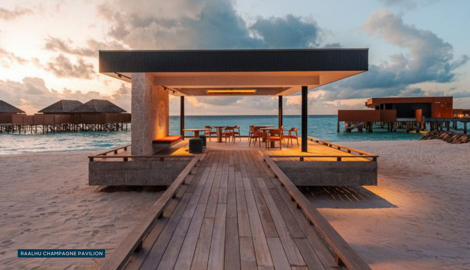
RAALHU CHAMPAGNE PAVILION