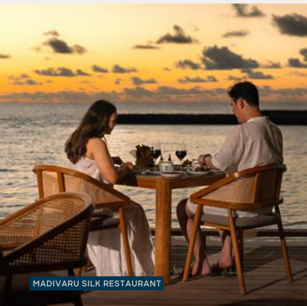
MADIVARU SILK RESTAURANT

Step into a culinary adventure at MADIVARU—The Silk Restaurant & Teppanyaki Grill, where ancient trade routes serve as the muse for each dish.