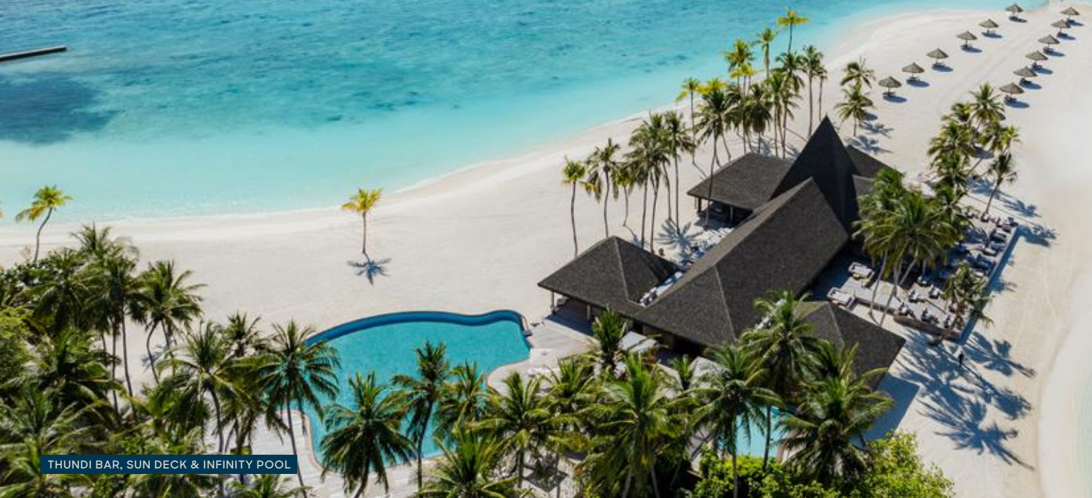
THUNDI BAR, SUN DECK & INFINITY POOL